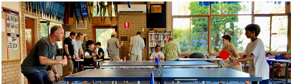
Table Tennis Night