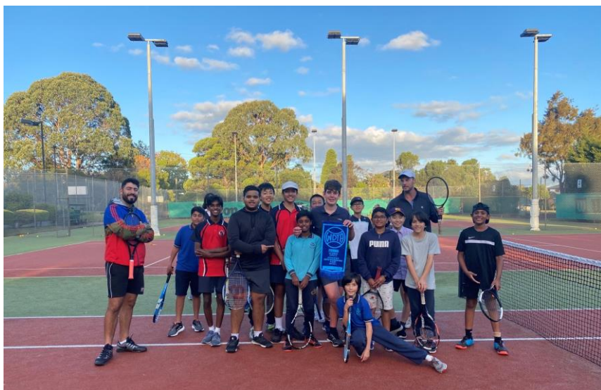
D2 Special Team with their training squad