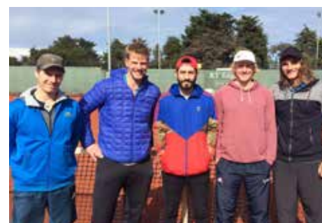
Last year's Grade 1 Pennant team.